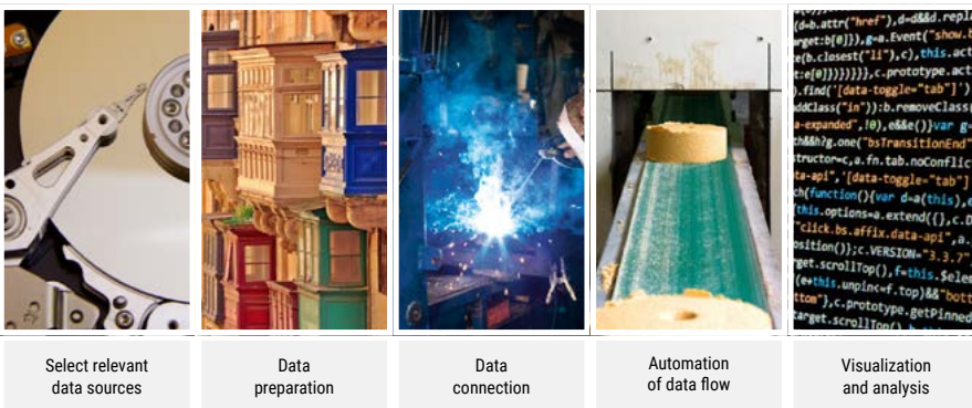
A look behind the scenes | Data integration